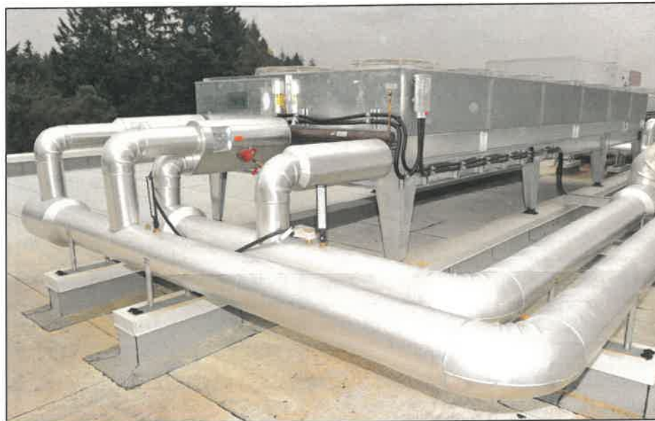
BC Insulators are spreading the MI word across Canada.