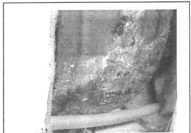
Corrosion and condensation in new Vancouver condominiums